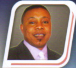
Bishop Joe Umeke

Presiding Bishop of Vineyard International Ministry Bronze Newyork